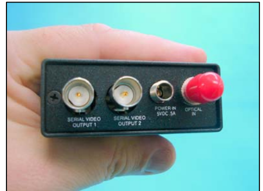
Small, Compact with Re-clocked, Loop-Through Input and Dual Re-clocked Outputs